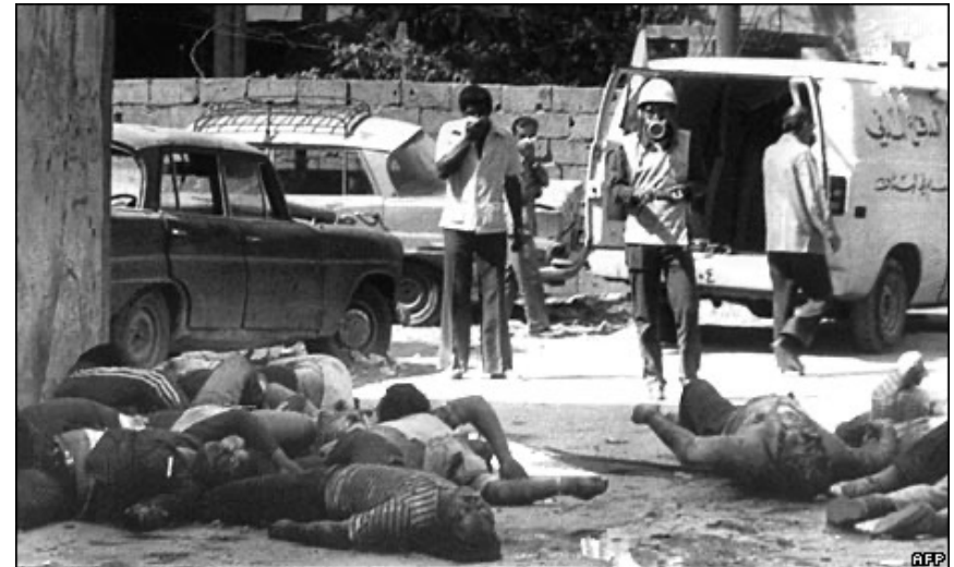
Bodies of Palestinians killed in Sabra refugee camp in September 1982

A. Abarbanel. (2021). Exiting Zionism - a former Israeli's awakening . Kairos Puget Sound Coalition Seattle. 7th Fall Conference.