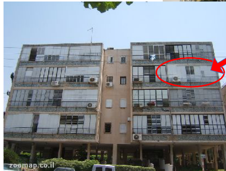
Flat 12, 3 Hashikma Street, Bat-Yam