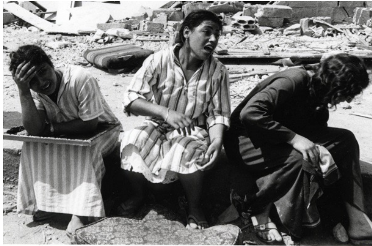
Survivors of the Sabra and Shatilla refugee camp massacre

Kairos Puget Sound Coalition Seattle 7th Fall Conference (Sat., Oct. 23 rd 2021)